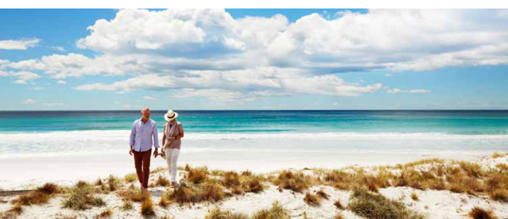
FREYCINET LODGE ****