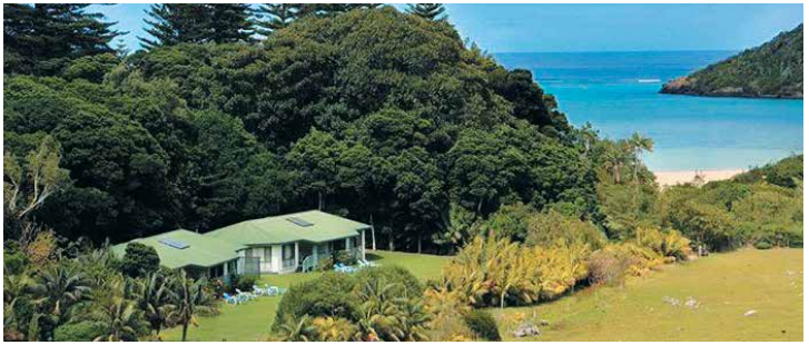
MILKY WAY VILLAS