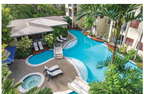
MERIDIAN PORT DOUGLAS