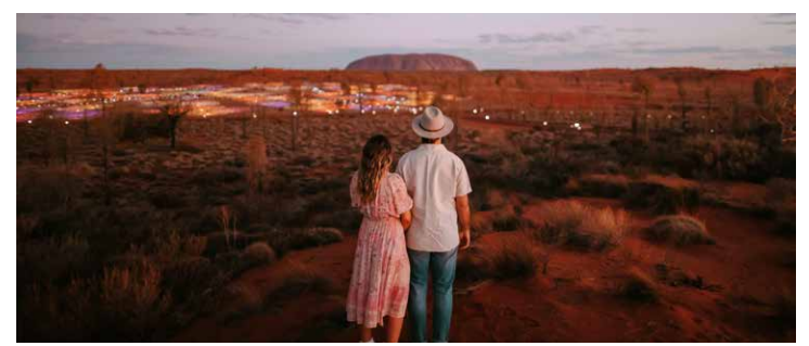
ESSENTIAL ULURU & LIGHTS EXPERIENCE ****