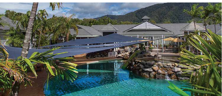
HOTEL GRAND CHANCELLOR PALM COVE