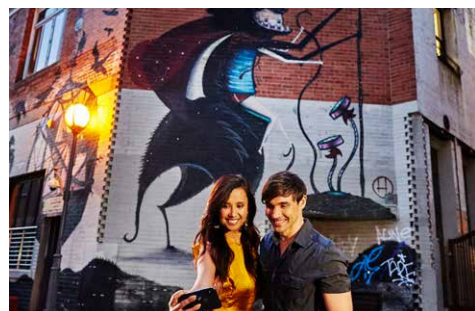
IBIS STYLES EAST PERTH ****

• 3 nights at ibis Styles East Perth in a Standard Room