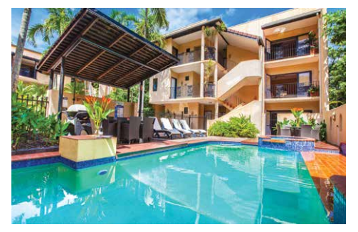
VILLA SAN MICHELE