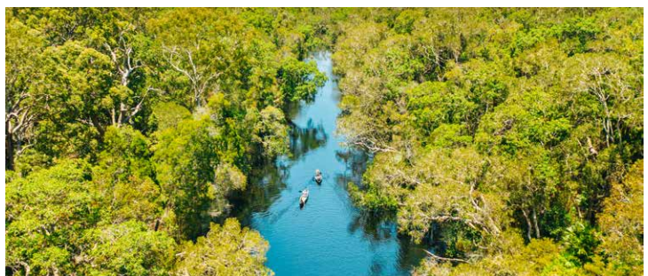
3 NIGHT NOOSA ESCAPE