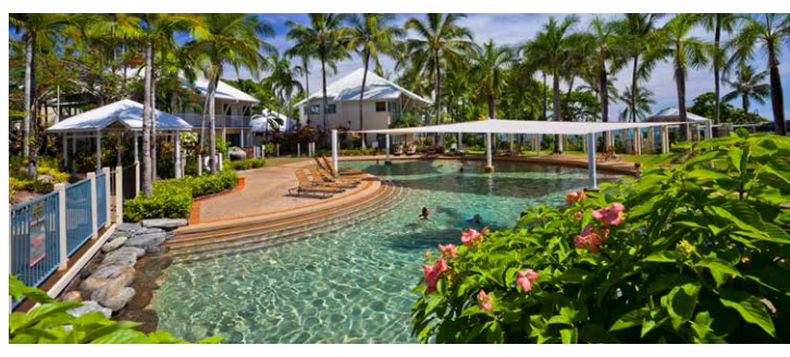
CORAL SANDS RESORT ON TRINITY BEACH