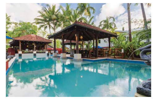
HIBISCUS RESORT & SPA