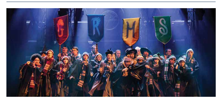
HARRY POTTER AND THE CURSED CHILD