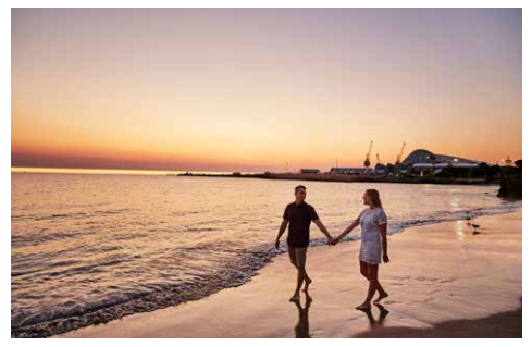
SEASHELLS FREMANTLE ★★★★☆