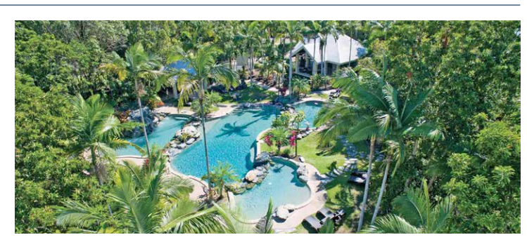
PARADISE LINKS RESORT