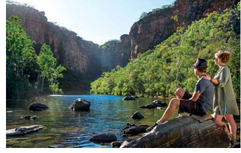
RAMADA SUITES ZEN QUARTER DARWIN ***