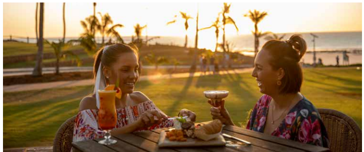
OAKS CABLE BEACH ★★★☆