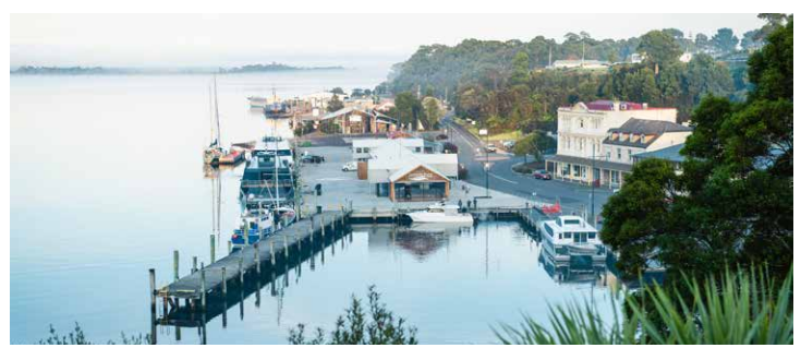
STRAHAN VILLAGE ***