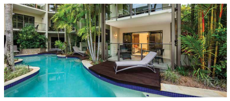
SHANTARA RESORT PORT DOUGLAS