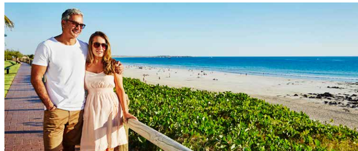
BLUE SEAS RESORT CABLE BEACH ★★★☆