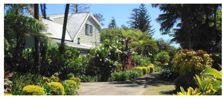
CHANNERS ON NORFOLK GARDENSIDE APARTMENTS