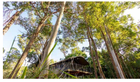
ULTIMATE WINERY ESCAPE